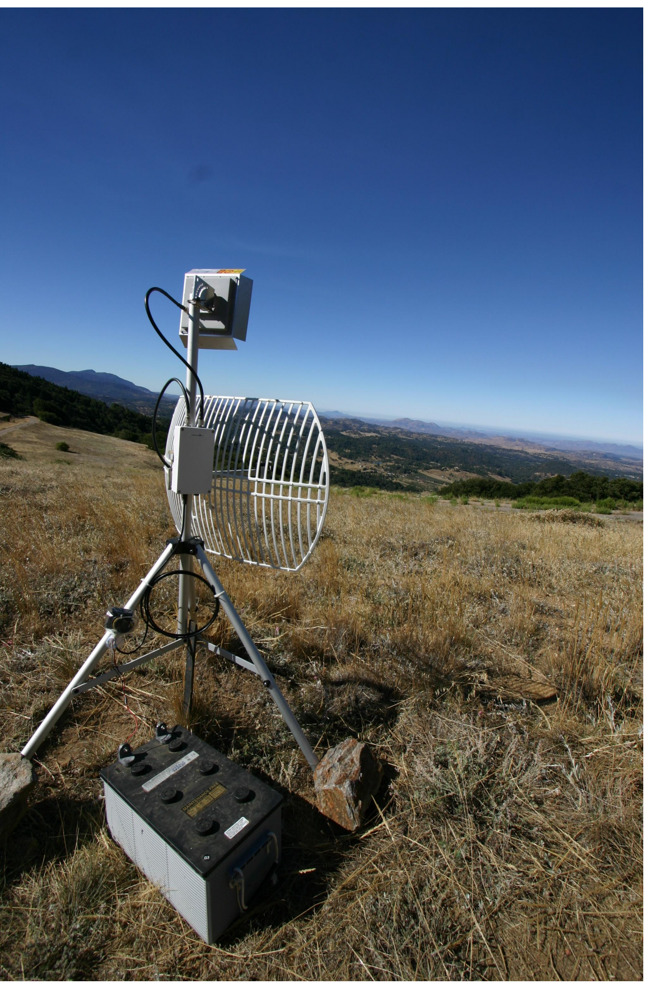
Volcan Fire antenna relay site

Due to the nature of repeated use on Incident Command Post sites, three designated ICP locations have been established for immediate use to support fire fighting efforts.